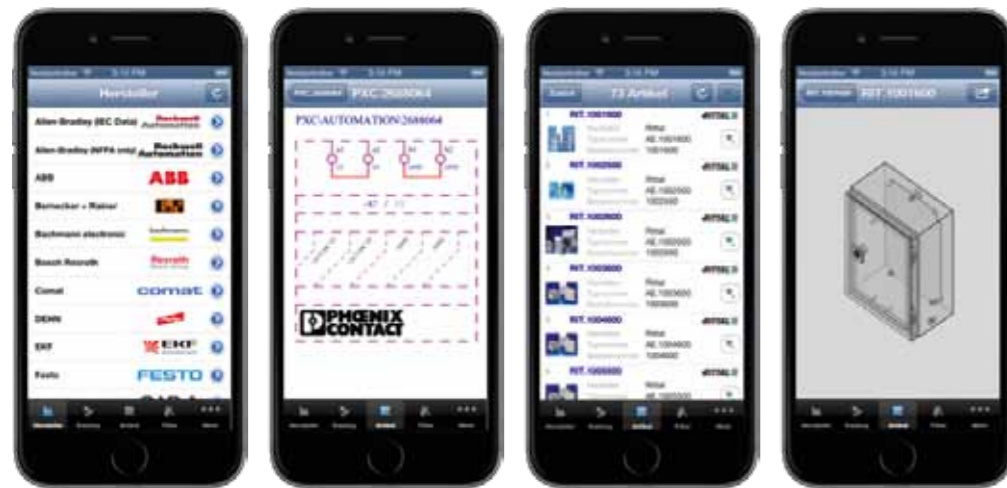
Manufacturer overview Representation of ECAD macros Parts in the product catalogue 3D viewer

Regardless of whether it's with an iPad or iPhone, your sales and distribution staff can show data to potential and established customers live and on site – be it sales information or a 3D model using the integrated 3D viewer. You can be sure you always have the right answer ready if the talk turns to digital device data and support of consistent processes.